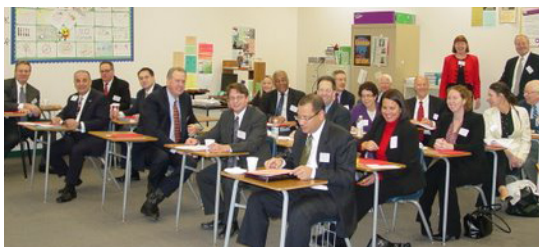
▲ Volunteer attorneys and judges get ready to judge the “We the People” southern Nevada regional district finals at Green Valley High School.