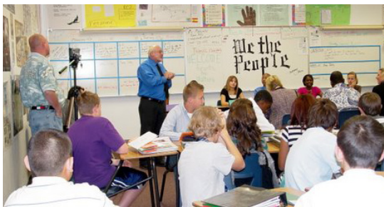
▲ Students from Saville Middle School demonstrate what they have learned through the “We the People” Program; at this point, only high school students participate in competition.