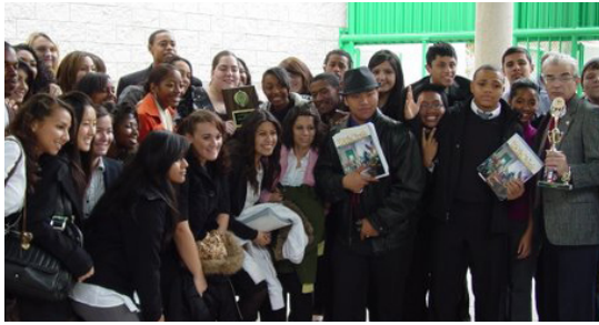
▲ The wild card team from Canyon Springs High School is one of several competing in the 2010 state finals.

Presently, only high school students practice their law-related education skills in competition, but students at Saville Middle School are using the “We the People” program to enhance their studies. Interest in the program is growing, and it is hoped that more Nevada middle schools will chose to participate in the future.